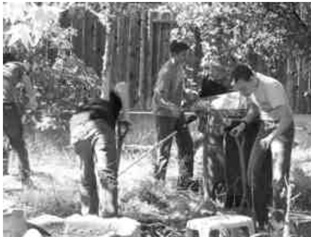
Students help widow with yard work on their Outreach Day, October 16th.

This year God orchestrated the reinstatement of this tradition quite perfectly. Because of His faithfulness, the organizational piece became a group effort. I asked the National Honors Society to be the outreach committee. Our school's newly implemented small groups played a big part in circumventing any confusion and difficulties in the planning process. The small groups are composed of around ten students and a teacher. Although the small groups were originally