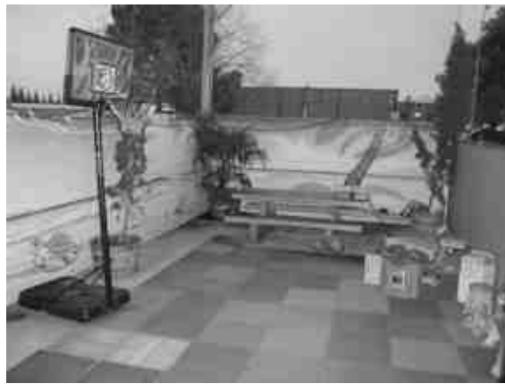
Butte Co. Social Services new visiting area

knew Jesus and this gave him the opportunity to speak of the way of the King. In his acceptance speech, he spoke of how the social workers embody the true meaning of the word blessing as they kneel to tie the laces of a person's life. He went on to say that Jesus deepened the meaning of this by adding that the greater should serve the lesser, and that social workers live this out.