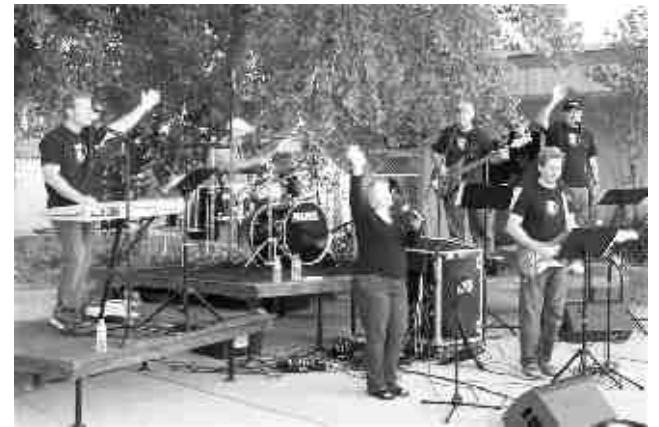
WeR1 Band invites God's presence onto Oasis School campus.