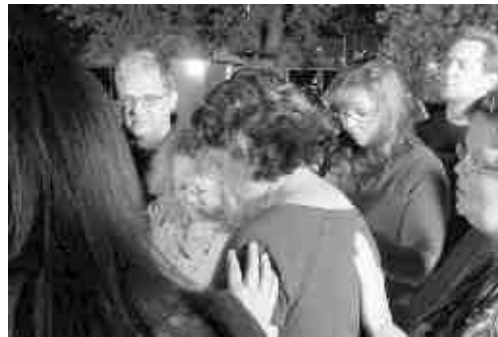
Teachers receive prayer.