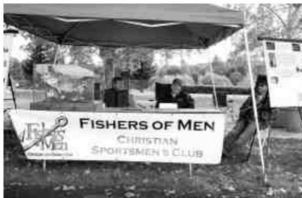
Booth at the Return of the Salmon festival

"The discipleship, the events, the friendships and camaraderie that are all a part of Fishers of Men have been essential to my transformation. I am now a minister to my family and friends, and even a leader in the club. The friendships that have developed through the club are treasures to me. I have witnessed the power of prayer in real ways and have been able to show God's love to others; but most importantly, I have the knowledge of who my God is, and am able to show other men who He is, how real He is. I have no doubt that we have