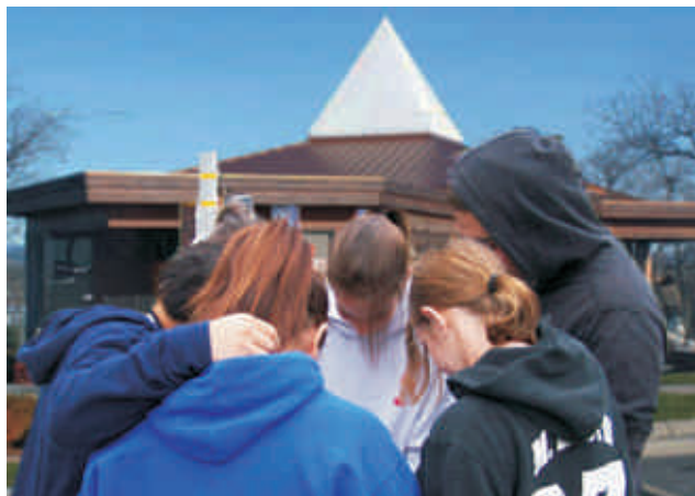
Before going out to minister, the group gathers to listen to God's direction

We decided to go to the football game where my son and his friends were. We found them and I asked if we could pray for my son's friend; he agreed. He felt the presence of God and wanted to give his life to Jesus on the spot. As we looked up, we saw 3 girls. We told them God was present and asked them if they wanted to feel His presence. They said, "Yes," so we prayed for them. They bolted saying, "We didn't feel anything."