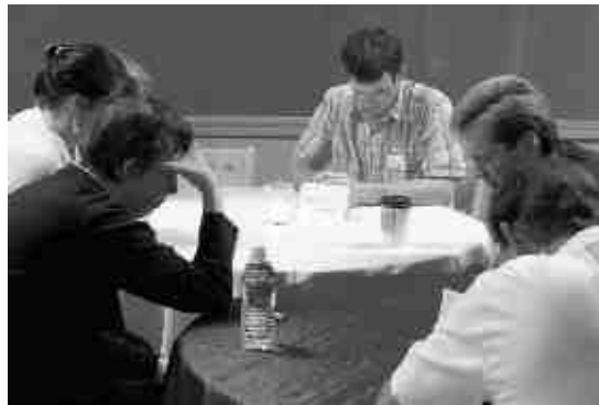
United believers pray for specific Anderson needs at ARISE in September.

As a growing vision of "transformation" is spreading throughout South County, the word "hope" seems to best describe the underlying mood. People are starting to truly believe that God is moving in this region, wanting to transform the region, by transforming the hearts of the people in the region. As one person shared, "We are beginning to use a new vocabulary - one that is common between churches: 'South County transformation' ... 'marketplace ministry' ... 'each of us walking out our destiny' ... 'honoring our leaders.'" Did you catch that this person said,