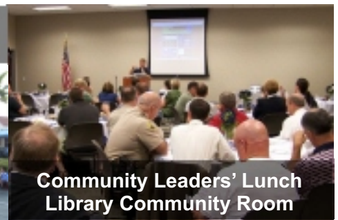
Community Leaders' Lunch Library Community Room