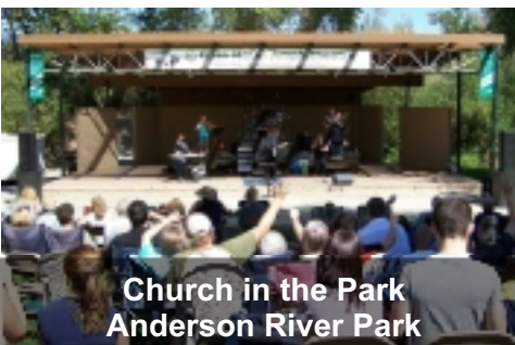
Church in the Park Anderson River Park

Between meetings though, I drove to a local trailer park whose dispute between tenants and owners made front page news here last Sunday. The situation is not pretty and really needs God's grace to get in there. It's a real hot spot of turmoil and ugliness in the city. As I arrived, the people were being evacuated due to a fire that was burning nearby. My hope was to find out how we could come alongside them without taking sides