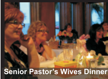
Senior Pastor's Wives Dinner