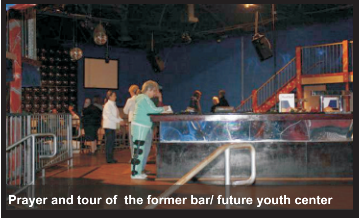
Prayer and tour of the former bar/ future youth center