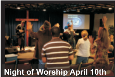
Night of Worship April 10th