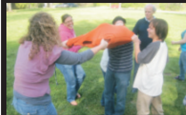
Mentoring party in the park