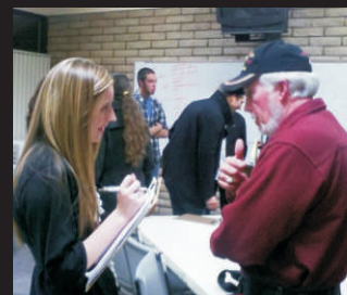
Connecting across denominations, generations & more