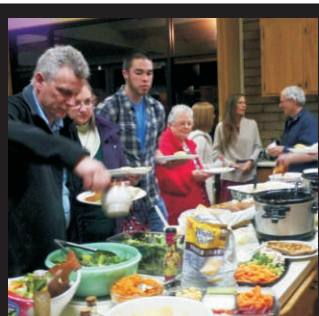
Monthly 1net Dinner

Yes, I truly believe something has shifted and we are in a whole new realm. **Think Narnia and the coat closet. Many of us underwent a "depths of despair" season (some without the despair, but definitely some depths) and we are emerging alive and well. So, this is going to be an exciting time, breathing some new air and joining forces. The words reset and refresh will be helpful as we look to what's ahead. Reset your hope meter to HIGH, and refresh your page of dreams and vision because a wave of new possibilities is coming with joy this year. Partnering will take on a whole new meaning, and finding those to journey with will be common. Philippians 2:4 is coming alive in 3D, "Each of you should look not only to your own interests, but also to the interests of others." The Body is being placed in order as people recognize their role and affirm other's roles.