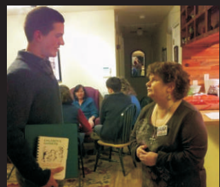
Volunteers planning for Manter activities