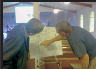
Anderson Church with its eyes on the city.