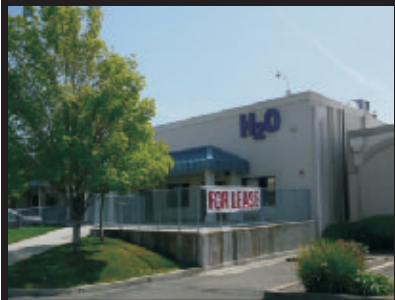
Potential day center for teens