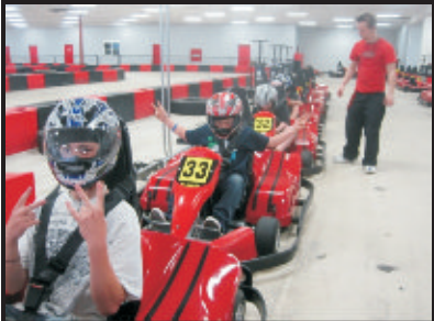
Go Karting with mentees