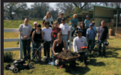
Grace in Motion Team, 3/27

"So, how many youths from our caseloads can I refer to you?" asked the probation officer.