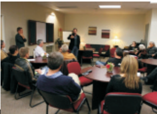
Champions thinking city