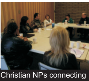
Christian NPs connecting