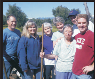
Bringing God's grace and love