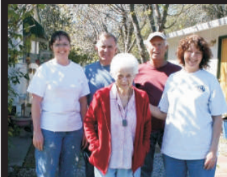
Coming alongside with tools, smiles, and prayer