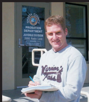
Working with Probation for maximum impact