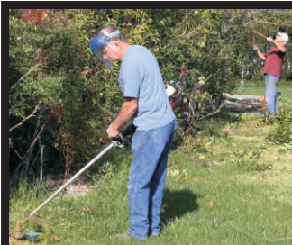
Grace in Motion serving widows together