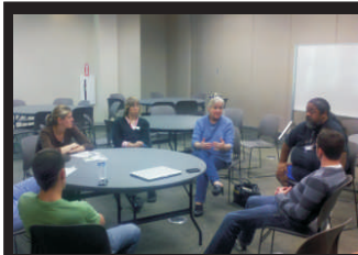
Monthly meeting connecting community youth leaders

If the rest of this year is anything like this first month, we will be accomplishing a TON in 2011. We will also be broke (smiling here) and we will also have experienced one heck a lot of warfare. On the docket for this year:: a regional transformation conference featuring some of the mighty men and women of God in the nations who are seeing tangible results play out as they walk in faith, a fully renovated event center (night club turned useful for building up lives instead of tearing them down), a high octane mentoring program which will touch upwards of 100 of the more broken teens in our region each week, an expansion of the WeR1 family umbrella, a prayer force which will be praying into community breakthroughs on a regular and consistent basis, a variety of focus teams who initiate change in business realm - education realm - social service realm, and much much more! Can you say YEEAAAAHHH?