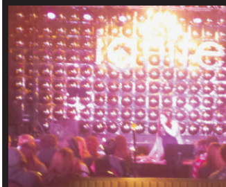
Various groups renting The Crossing for their events.