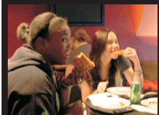
Mentor pairs enjoy conversations, music, art and PIZZA!