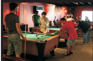
Project 18 mentee party at The Crossing hosted by Bethel students