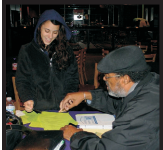
Survey follow up - working together for Redding youth.