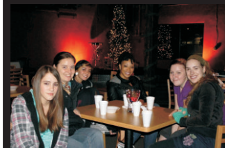
Mentor pairs introduced at The Crossing