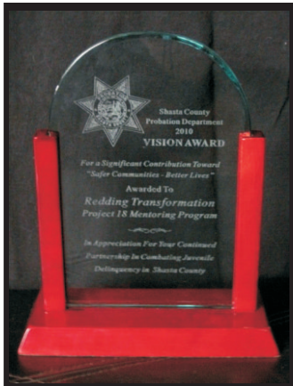
Project 18 wins Probation's Vision Award

Making transformation tangible is this year's theme. Transformation is God's grace landing down on a person or a situation, a people group, city or nation in such a way that everything changes to better reflect God's will and ways. It's meant to be a reality that is experienced, something pure and tangible, something extraordinary and unique, not just an ideal for someday over the rainbow. Transformational testimony seems to abound in the lives of those who walk in step with God's Spirit of adoption (not as orphans), whose lifestyle is rooted in, and expectant of, God's grace. It also seems to show up more through a path of simple obedience and walking through the doorways God opens.