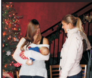
Building relationships with CALSafe students